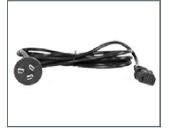
AC Power Cable Product Number: 9000097CABLE