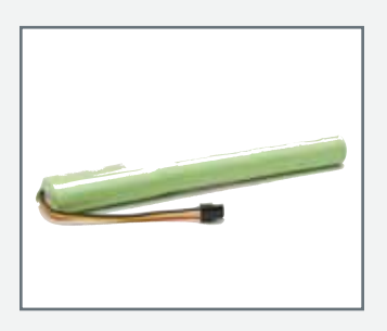
Replacement UPS Battery Product Number: VM1376BATTERY